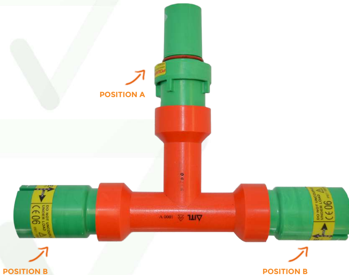
EXAMPLE SHOWS: T-PIECE PD-1 PS-2 E G T8

Powersafe Insulated T-Piece connectors allow the option to split one phase into two or combine two phases into one, in a quick and safe manner. The connectors are colour coded and mechanically keyed to avoid connection errors.