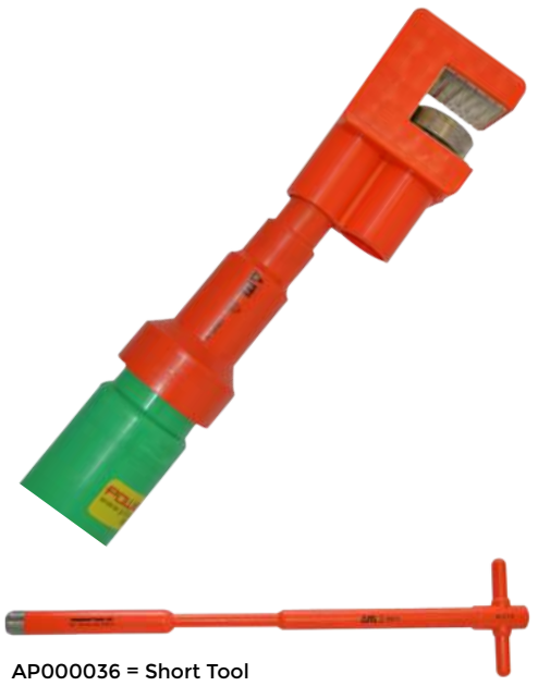
AP000036 = Short Tool AP000028 = Long Tool

* Standard use is Source Connection. If you require Drain connectors please ask.