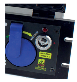
800A Capacity Phase 3's level of Quality is unmatched, Our Distribution Boxes have a high current rating of 800A, Max Capacity.