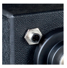
Remote Control Each Distribution Box has a connection to allow remote control, for your convenience.

M12 Cable Lug Universal Connections, like M12's, make the Distribution box so versatile. Compatibility for everyone.