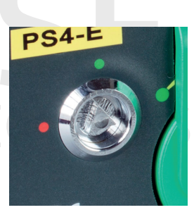
Locking Key System Keep the box secure with a Key locking system, ensuring only authorised individuals can operate.